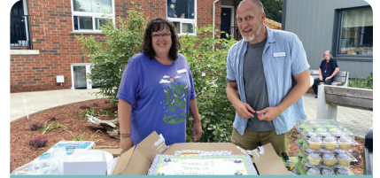
Woodstock's 20th anniversary, Blossom Park, Woodstock

636 people connected directly with intake staff