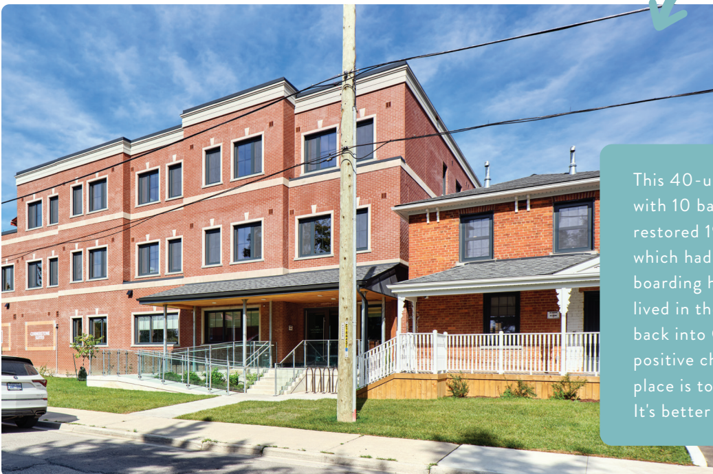
Cornerstone Suites in Mississauga opened to tenants in July 2024.

This 40-unit supportive housing program, with 10 barrier-free units, includes two restored 19th-century heritage homes which had previously been run-down boarding houses. Some of the tenants who lived in the older boarding houses moved back into Cornerstone Suites, praising the positive changes: "This is healing — this place is totally different, but it's my home. It's better this way."