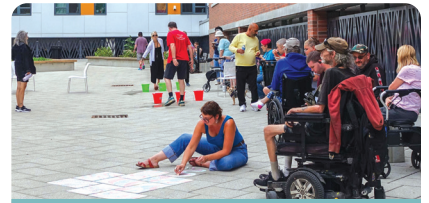
Tenant's fun day, The Oaks, Hamilton