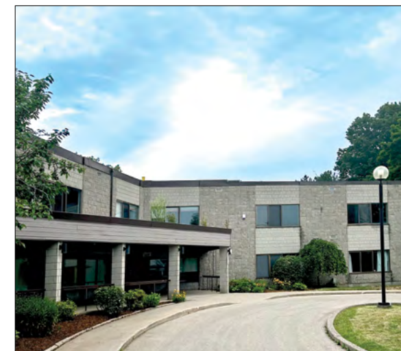
46 Elmwood Place, 50 units, opening 2025