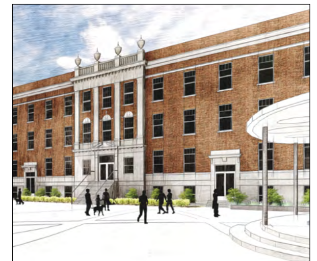
War Memorial Children's Hospital, 42 units, opening 2026

For 50 years Indwell has been providing supportive housing that transforms lives. Every door we open together becomes a solution to homelessness.