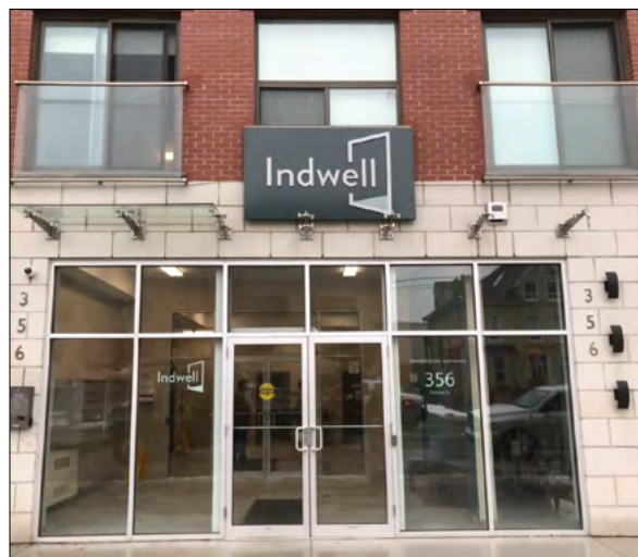
Woodfield Gate, 66 units, 2019

Indwell provides 182 units of supportive, affordable housing, with 92 more under construction.