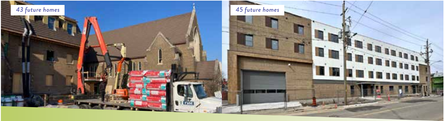
St. Mark's Place (left), Kitchener, completion fall 2023 and The Station (right), St. Thomas, completion summer 2023

We have more doors opening later this year!