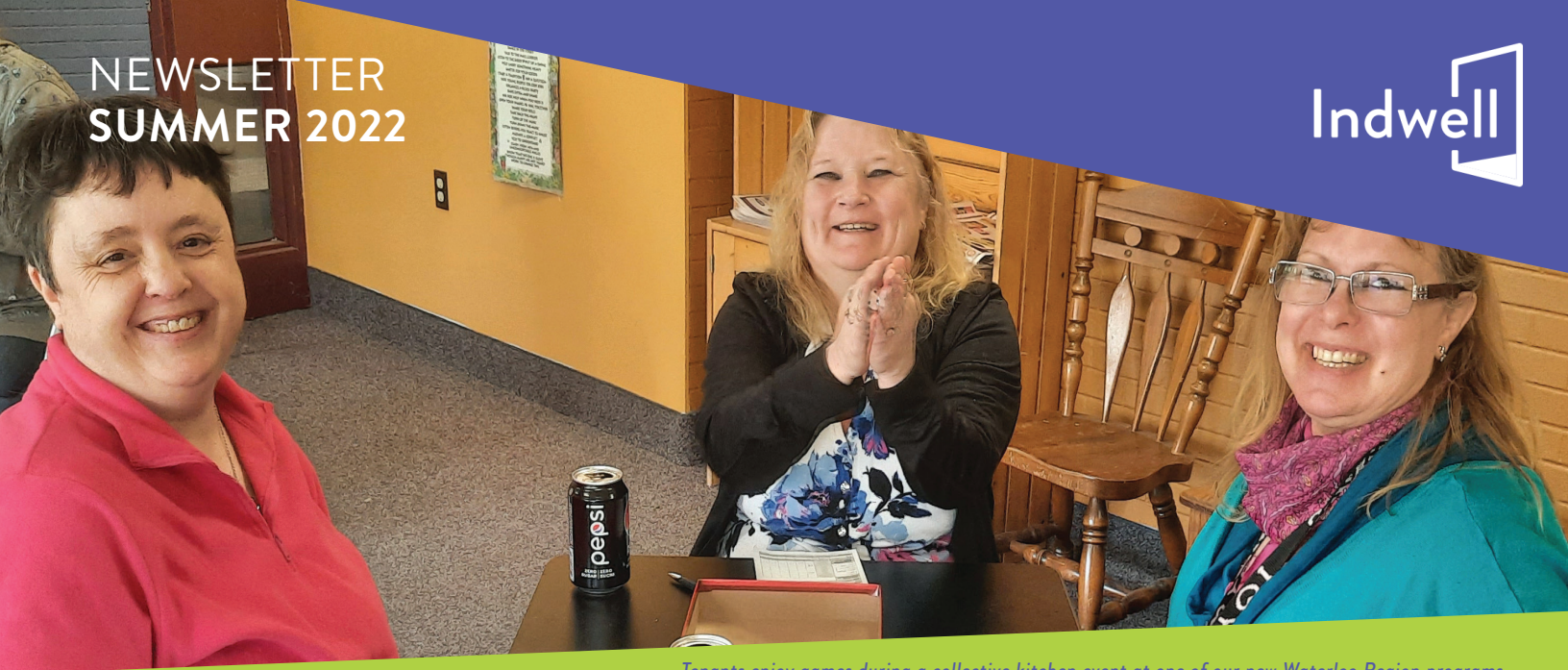
Tenants enjoy games during a collective kitchen event at one of our new Waterloo Region programs.