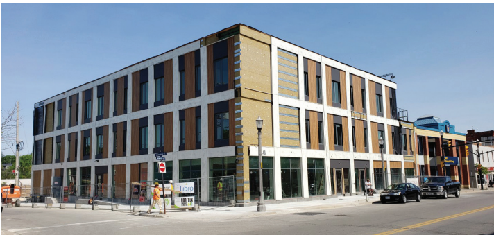
Dogwood Suites. Over the summer, we'll add a few more finishing touches to the exterior of the building.

Several years ago, community and government partners worked together with us to restore this building into supportive affordable housing and a hub that would serve the community and beautify the neighbourhood. We're thrilled for what the future holds for each of the 51 tenants—and for the town of Simcoe!