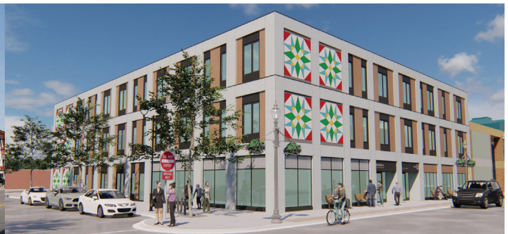
Rendering of completed Dogwood Suites, Simcoe, with quilt motif mosaic, by Invizij Architects Inc.

More programs are opening over the summer, so stay tuned for exciting events like Open Houses in your community!