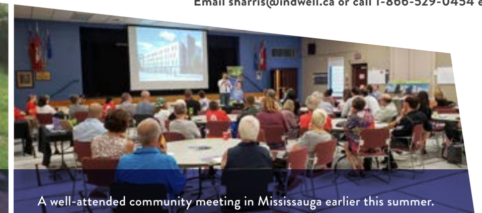
A well-attended community meeting in Mississauga earlier this summer.