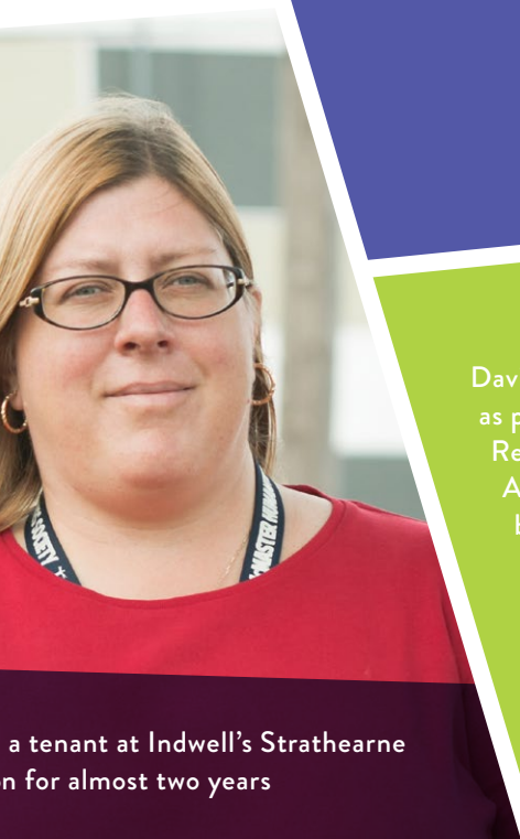
a tenant at Indwell's Strathearne n for almost two years