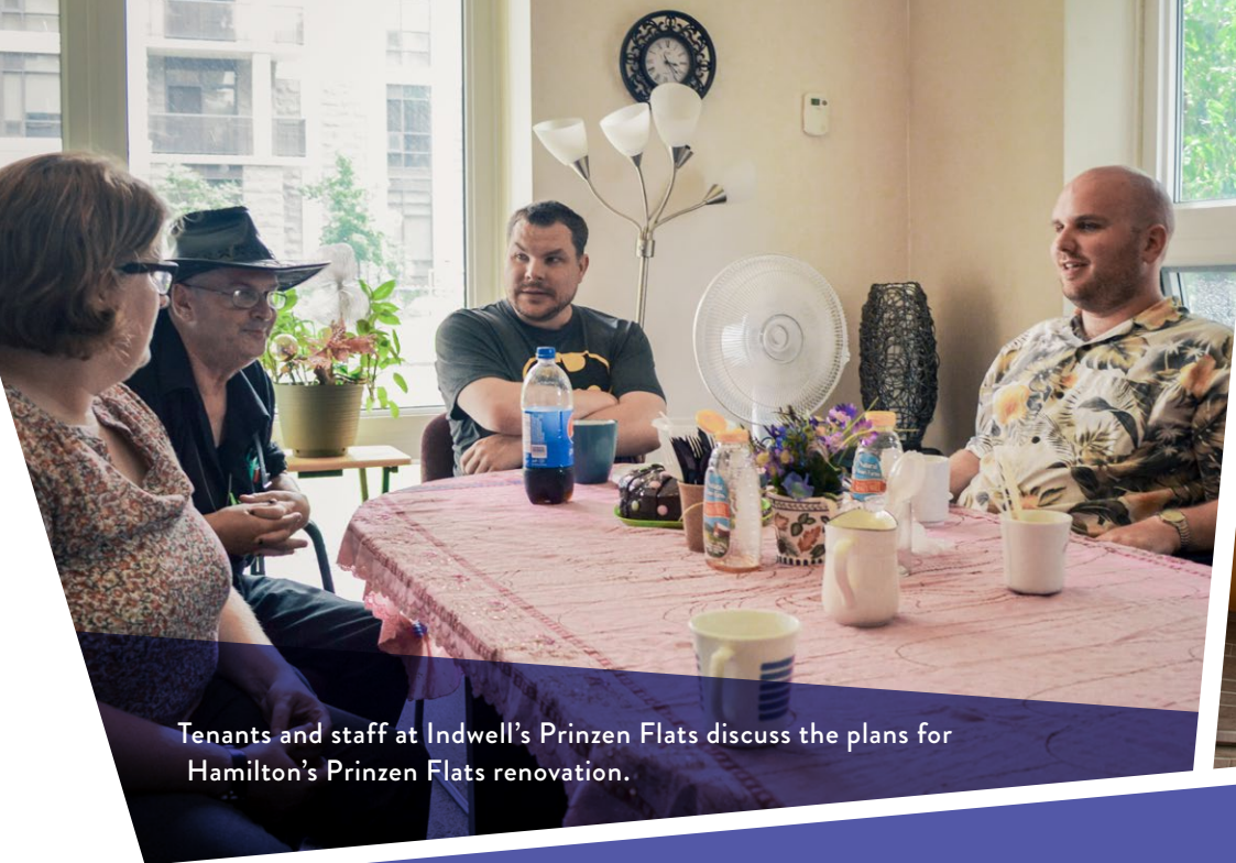
Tenants and staff at Indwell's Prinzen Flats discuss the plans for Hamilton's Prinzen Flats renovation.