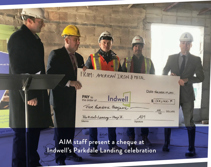
AIM staff present a cheque at Indwell's Parkdale Landing celebration

76,650 meals served in our higher-support programs