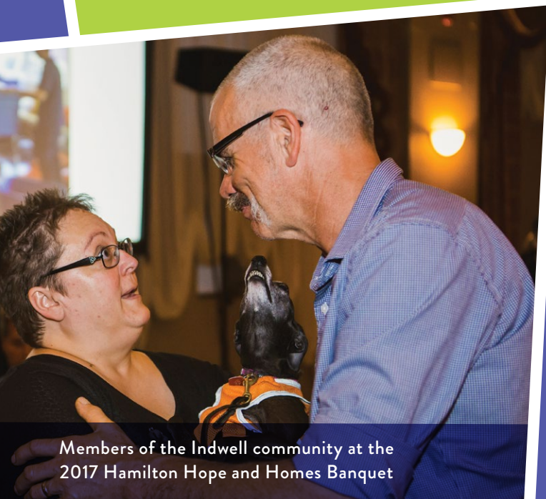
Members of the Indwell community at the 2017 Hamilton Hope and Homes Banquet