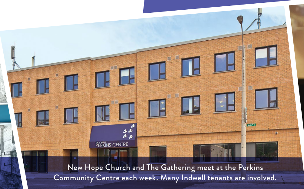
New Hope Church and The Gathering meet at the Perkins Community Centre each week. Many Indwell tenants are involved.