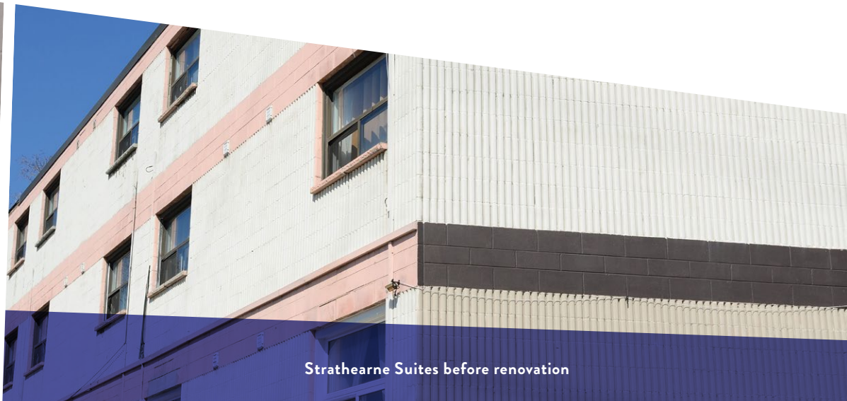
Strathearne Suites before renovation